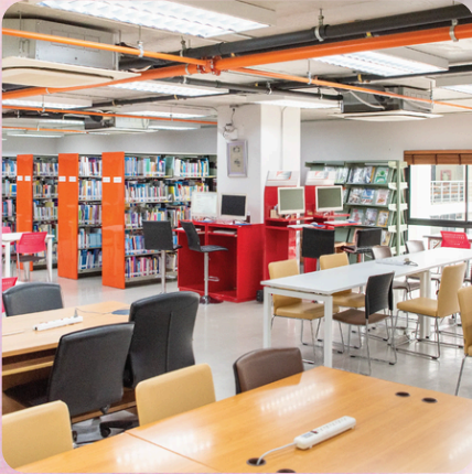
ECON CMU Library