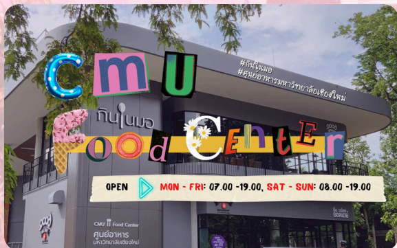
CMU Food Courts