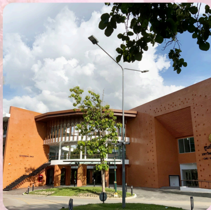
CMU Health Center