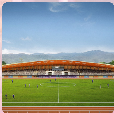
CMU Sports venues