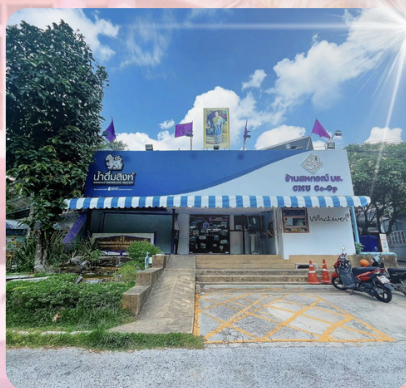
Chiang Mai University Cooperative Store